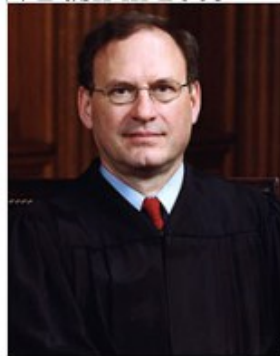
Samuel A. Alito Nominated by George W. Bush in 2005