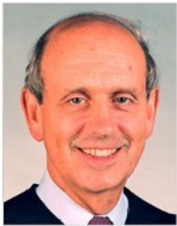
Stephen G. Breyer Nominated by William J. Clinton on May 17, 1994