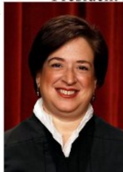
Elena Kagan nominated by Barack Obama in 2010