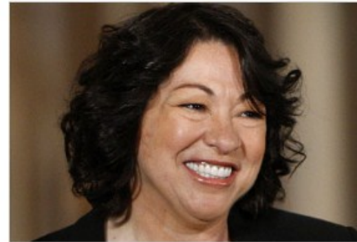
Sonia Sotomayor Nominated by Barack Obama in 2009