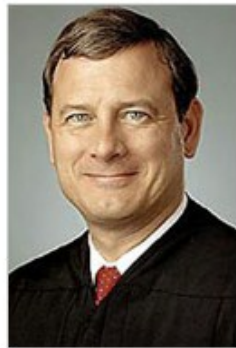
John G. Roberts Jr. nominated by President George W. Bush in 2005