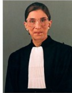
Ruth Bader Ginsburg Nominated in 1993 by President Bill Clinton