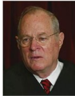
Anthony M. Kennedy Nominated by Ronald Reagan in 1987