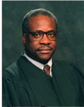
Clarence Thomas Nominated by George H.W. Bush in 1991